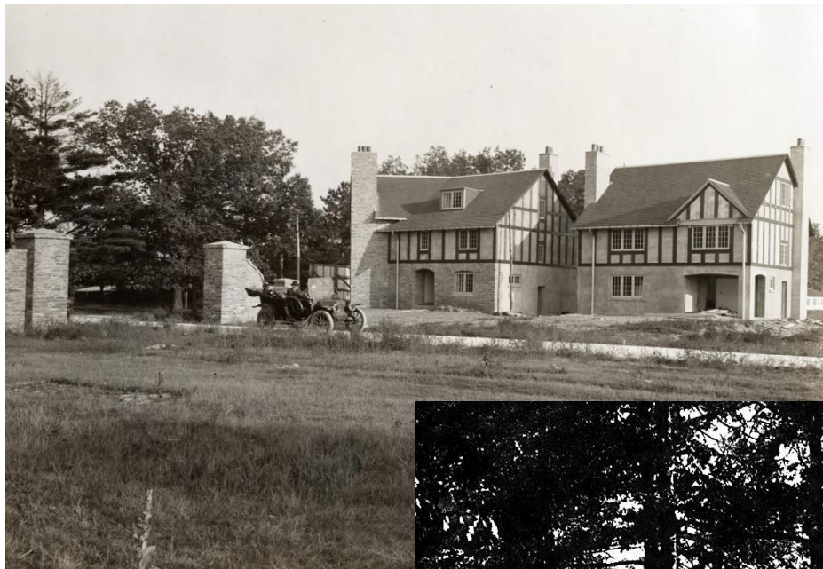
The Baby Point Gates amidst construction around 1913.